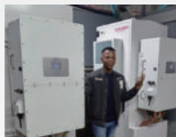
South Africa OASIS 60 & Deye 50kW/120 kWh Outdoor Battery Cabinet System