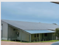
South Africa OASIS 60 & Deye 200kW/240 kWh Outdoor Battery Cabinet System