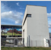
Slovakia OASIS 60 & Solinteg 50kW/60kWh Outdoor Battery Cabinet System