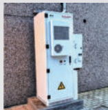
Italy OASIS 60 50kW/60kWh Outdoor Battery Cabinet System